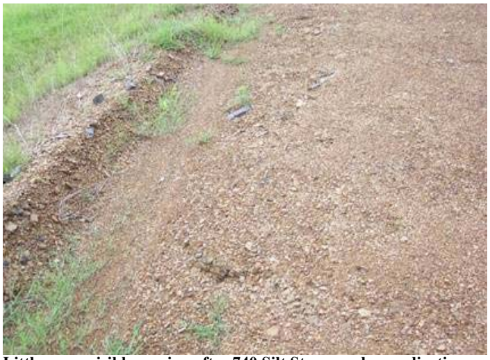
Little or no visible erosion after 740 Silt Stop powder application

Applied Polymer Systems, Inc. 519 Industrial Drive Woodstock, GA 30189 678-494-5998