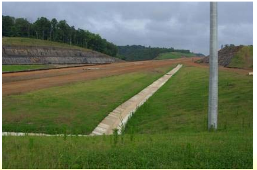
The new road bed lay erosion free for 6 month using APS 740 Silt Stop powder

The Alabama DOT approved the use of PAM (polyacrylamide) as a measure for controlling erosion (Spec #672). In November 2003, Skip Ragsdale, owner of Sunshine Supplies, Inc., was contacted to see if there was a way to use only PAM for controlling erosion. Skip, a distributor for Applied Polymer Systems, Inc. products, recommended the use of APS 740 Silt Stop powder. The roadbed would require 500 pounds of APS 740 at a cost of $3,500.00. In late November, W.S. Newell contracted with Parker Grassing Co. of Opelika, AL to apply PAM. Parker Grassing used a HydroSeeder to spray all 49 acres of the roadbed with a mixture of APS 740 Silt Stop powder and water to stabilize the exposed soil and prevent erosion. This spray application would have to last until the paving of the road began.